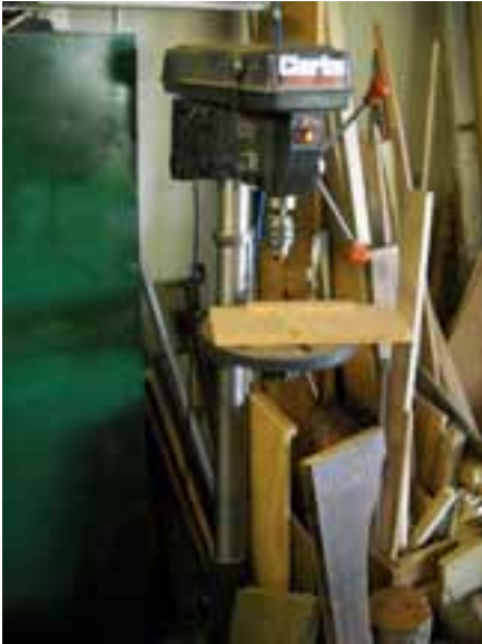
Clarke drill press: $125