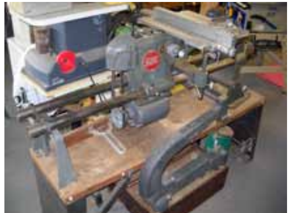
ShopSmith 10 ER and accessories: $150