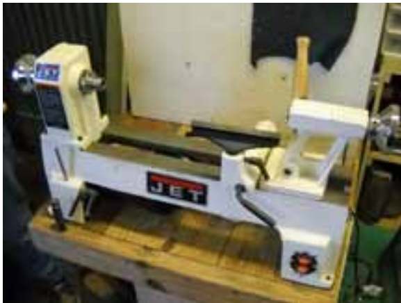
Jet mini-lathe: $175