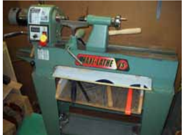
General lathe with stand: $550