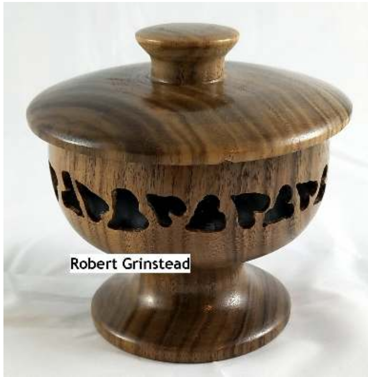
July - Beads Of Courage Bowl